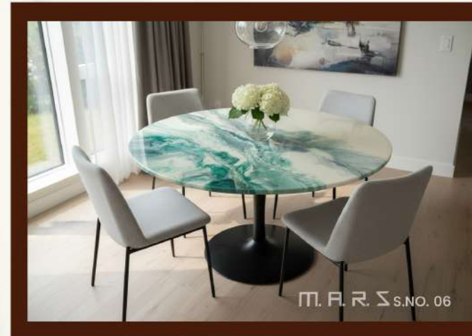
M.A.R.S S.NO. 06