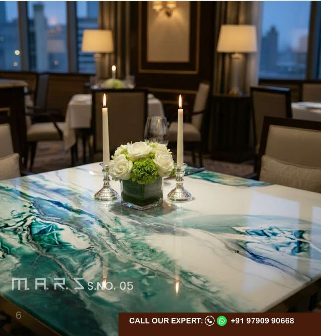
M.A.R.S S.NO. 05