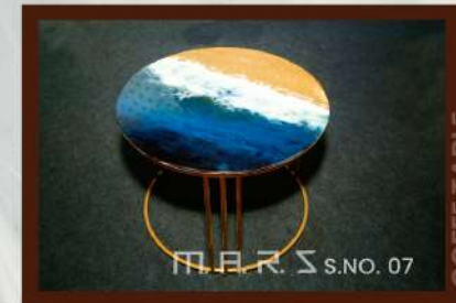
M.A.R.S S.NO. 07