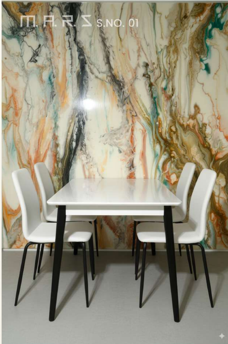
WALL BACK DROP/ HIGH LIGHT